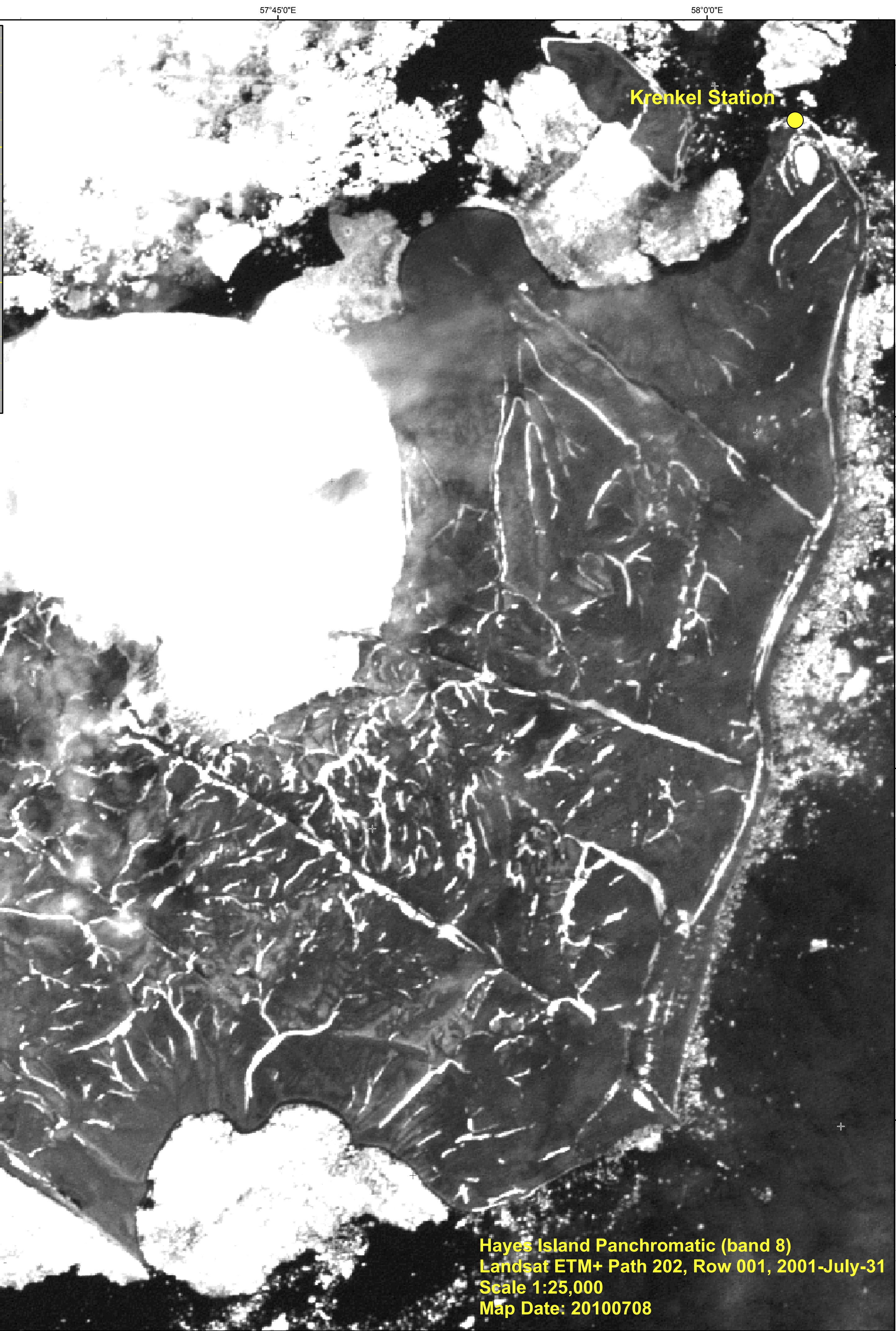
Hayes Island Panchromatic (band 8) Landsat ETM+ Path 202, Row 001, 2001-July-31 Scale 1:25,000 Map Date: 20100708